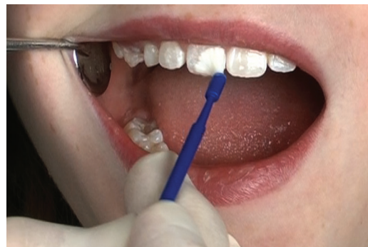
Enamel Pro Varnish is easy to apply and aesthetically pleasing.